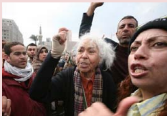
79 year old Egyptian feminist Nawal Al Sadaawi joins protests in Tahrir Square

100 years later and in the midst of a new economic crisis, working class women continue to fight back at the forefront of struggles in our workplaces and communities as well as in social movements calling for genuine equality, liberation, and peace.