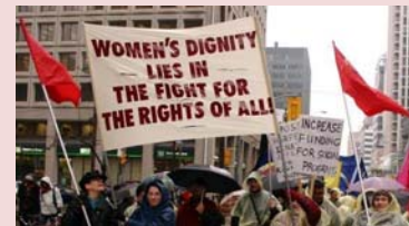
Toronto IWD 2010

100 years later and in the midst of a new economic crisis, working class women continue to fight back at the forefront of struggles in our workplaces and communities as well as in social movements calling for genuine equality, liberation, and peace.